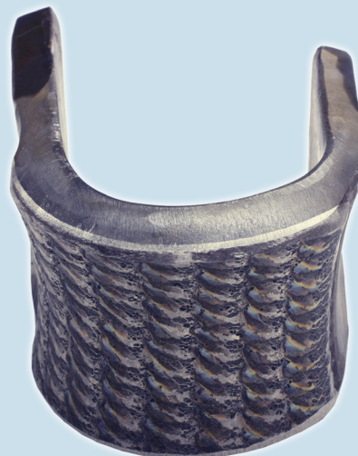
Face Bend: Optimum bead-to-bead tie-in.

Email: info@arcspecialties.com Web: www.arcspecialties.com